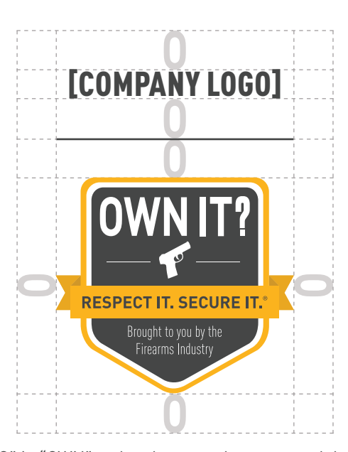
height of "O" in "OWN" = also the space between each logo and line